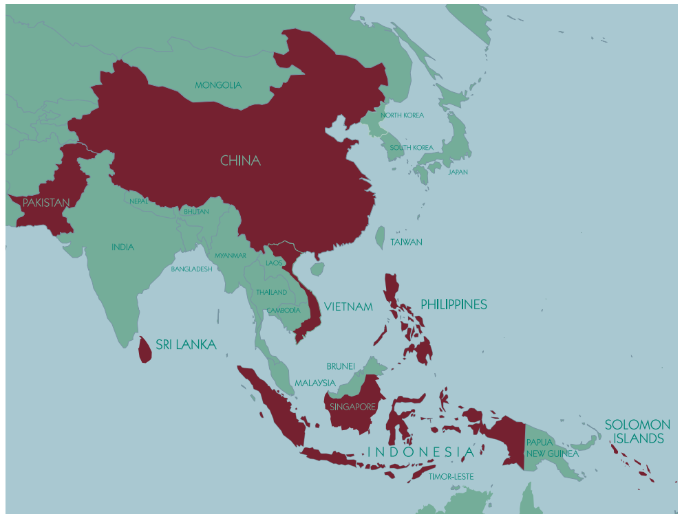
Map of Asia with countries shaded displaying American Red Cross disaster responses.

Between September and December 2006, five typhoons slammed into the Philippines resulting in 650 deaths, 700,000 people displaced and 2.5 million people affected. Two of these typhoons also hit Vietnam and affected an additional 1.3 million people. The American Red Cross deployed two disaster responders to the Philippines and contributed $850,000 to support relief efforts in both countries, collaborating with Movement partners to assist nearly 1.1 million people.