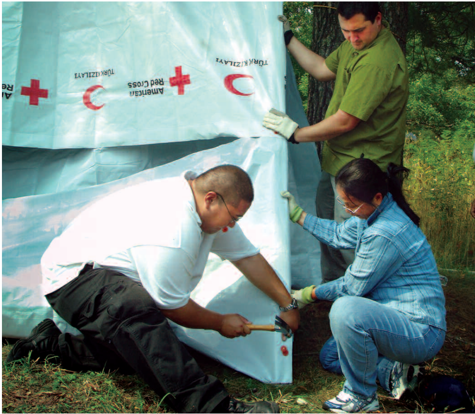
American Red Cross volunteers construct a temporary shelter during a training activity near Washington, D.C.

W hen international assistance is requested after a disaster strikes, the American Red Cross can respond by deploying disaster relief workers, mobilizing relief supplies and contributing funds received from our donors. Since disaster worker deployments is one of the three response options, the American Red Cross puts great emphasis on recruitment, training and building the expertise of our disaster responders. Sending skilled and trained workers to a disaster is fundamental to ensuring effective and appropriate humanitarian assistance. The American Red Cross also plays a key role in developing global training curriculums and improving disaster response tools to better support Movement partners.