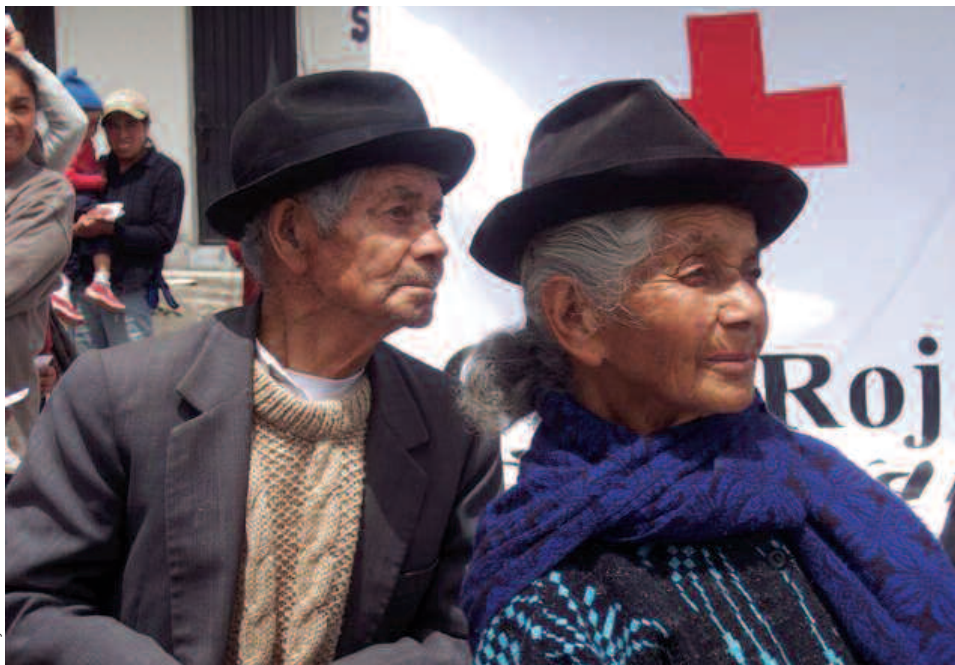
An Ecuadorian couple receives Red Cross assistance following a volcanic eruption in August 2006.