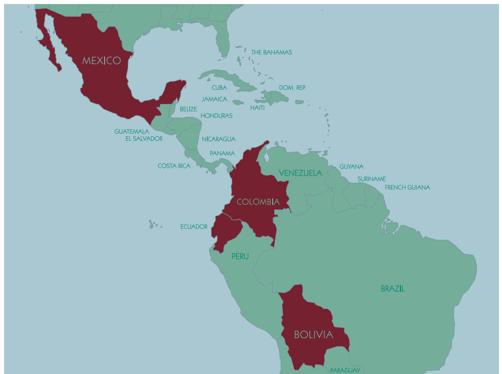
A man returns home carrying Red Cross relief supplies after massive flooding in Bolivia. Below: Map of Latin America with countries shaded displaying American Red Cross disaster responses.