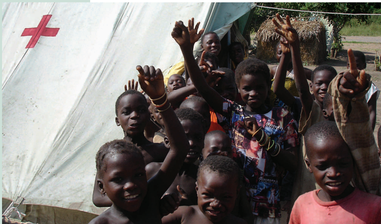
Children in Mozambique temporarily reside in accommodation centers supported by the Red Cross.

Your generosity enables the American Red Cross to respond to numerous crises and disasters around the world each year. On behalf of the American Red Cross and those we serve, thank you for your continued support of this important humanitarian work.