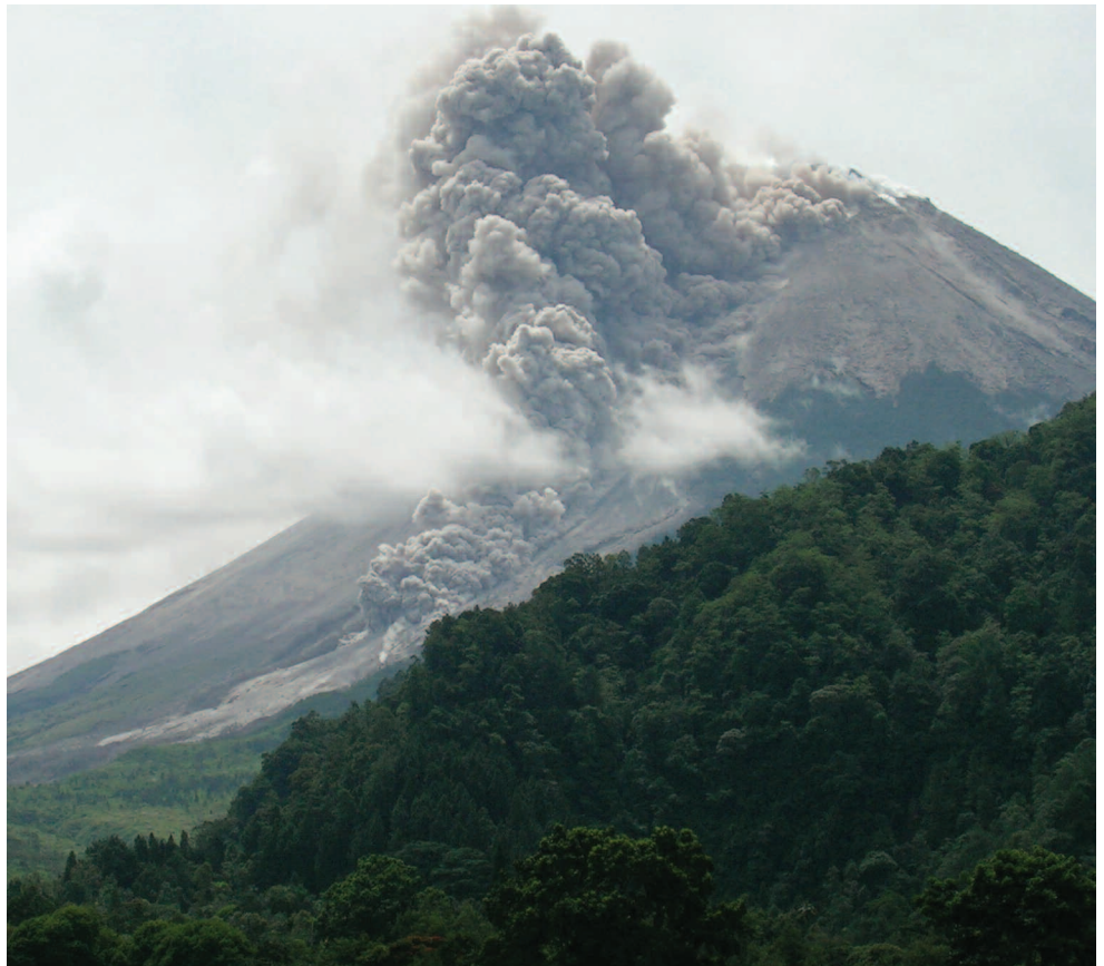
Indonesian Red Cross

The American Red Cross – with its Movement partners – helped an estimated five million people on six continents.