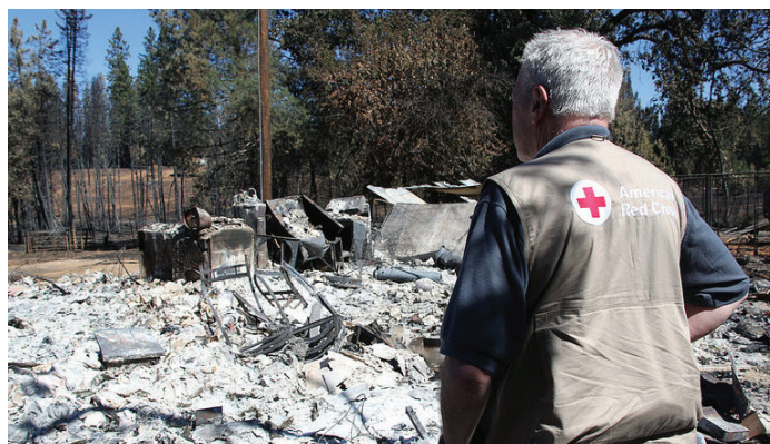
A Red Cross worker views damage caused by the Butte Fire in Mountain Ranch, Calif.