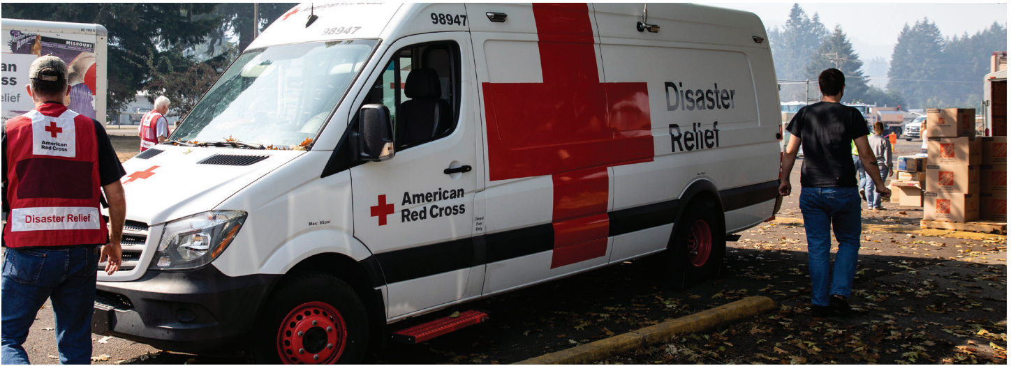
American Red Cross volunteers at work handing out wildfire and cleaning kits to families affected by the wildfires, near Lyons, Oregon.

Making a stand alongside these partners for an equitable and responsive recovery in Oregon, the Red Cross has committed $1.5 million to the fund to date. The Red Cross is focused on supporting an effective, equitable and inclusive recovery process—and one that is continually responsive to the needs of the diverse communities throughout Oregon.