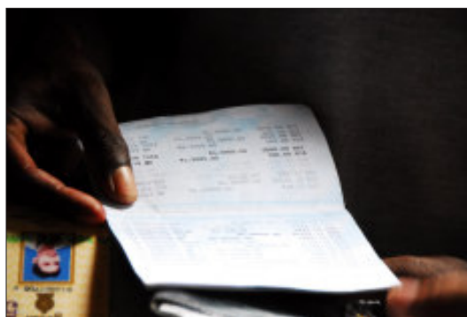
A Sri Lankan man holds a receipt showing he received a grant for the construction of the next phase of his house.