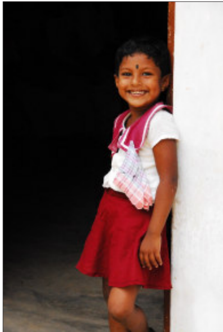
A Sri Lankan girl smiles as she watches a ceramic water filter presentation.