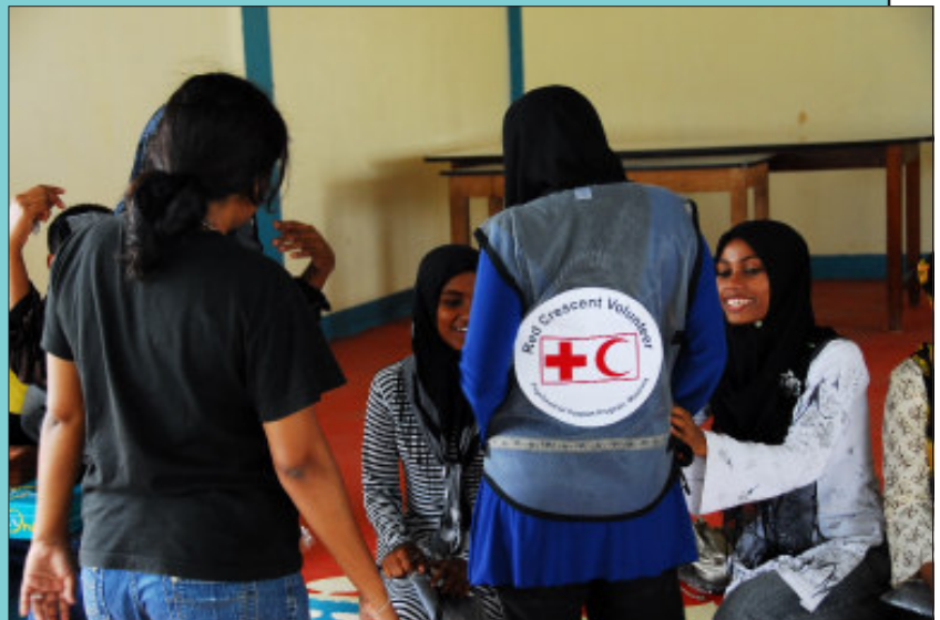
A new volunteer in the Maldives tries on her vest.

Community members have requested additional training so that more people can become Red Crescent volunteers.