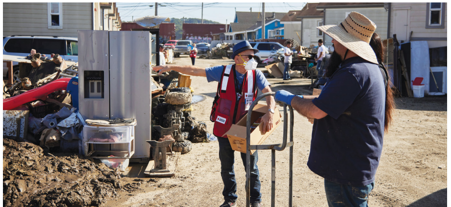
Red Cross volunteers distribute relief supplies to help residents clean up their waterlogged homes.

The Food Bank for Monterey County. Monterey County, California, home to hard-hit Pajaro, has the highest rate of food insecurity in the state, and to help families put food on their tables as they recovered from this costly disaster, the Red Cross gave funds to The Food Bank for Monterey County. With this grant, the food bank distributed fresh groceries to 300 families weekly for four weeks through May 31. For residents unable to earn a living during this disaster or who faced expensive repairs, these deliveries gave them peace of mind that their families would not go hungry.