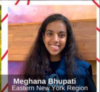
Learn more: https://tinyurl.com/ redcrossyouthFA

Ambassadors are a group of outstanding Red Cross Youth who