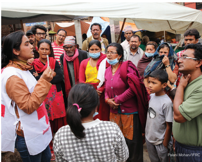
Nepal Red Cross volunteers distribute and train residents on using vital water purification tablets in Bhaktapur, Nepal.

The obstacles were daunting, with many survivors living in remote mountain villages cut off from the outside world by the earthquake. Nevertheless, the global Red Cross network has reached more than 620,000 people with lifesaving aid, providing cash grants and relief items to