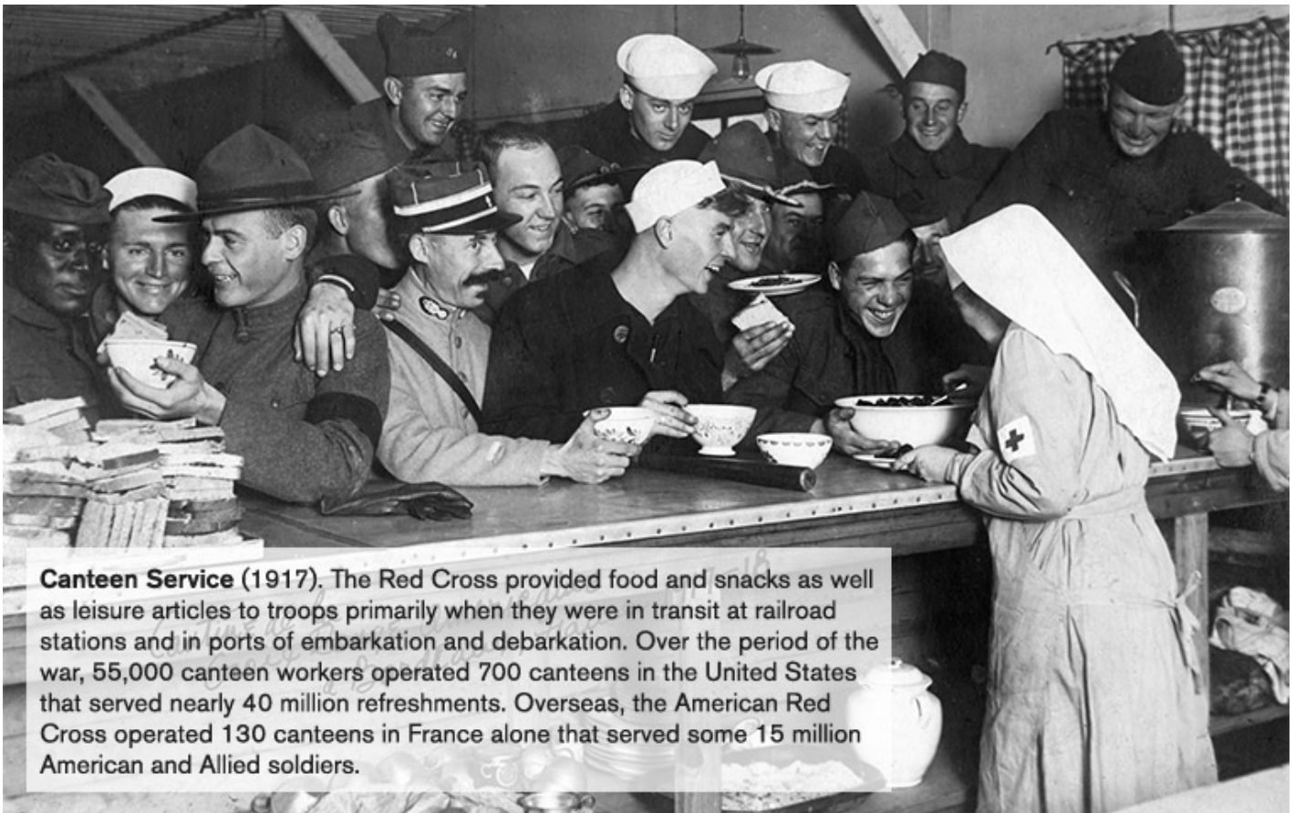
Canteen Service (1917). The Red Cross provided food and snacks as well as leisure articles to troops primarily when they were in transit at railroad stations and in ports of embarkation and debarkation. Over the period of the war, 55,000 canteen workers operated 700 canteens in the United States that served nearly 40 million refreshments. Overseas, the American Red Cross operated 130 canteens in France alone that served some 15 million American and Allied soldiers.

Nursing Service (1909). Already established as an important branch of the Red Cross before the war, the Nursing Service greatly expanded with the coming of hostilities. Its principal task became to provide trained nurses for the U.S. Army and Navy. The Service enrolled 23,822 Red Cross nurses during the war. Of these, 19,931 were assigned to active duty with the Army, Navy, U.S. Public Health Service, and the Red Cross overseas. The Red Cross also enrolled and trained nurses' aides to help make up for the shortage of nurses on the home front due to the war effort. Many Red Cross nurses and nurses' aides were enlisted in the battle against the influenza pandemic of 1918.