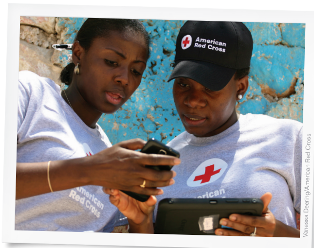
The American Red Cross continues to broaden its use of technology in Haiti, using tools such as GPS-enabled smartphones to collect and analyze information.

The American Red Cross would like to thank the many individuals, corporations, foundations and government agencies that so generously support our work in Haiti. Your contributions are making a difference in the lives of almost 4.4 million people in Haiti that we have reached since the earthquake. We are committed to spending your donations wisely to help the Haitian people recover, rebuild and be better prepared for the future.