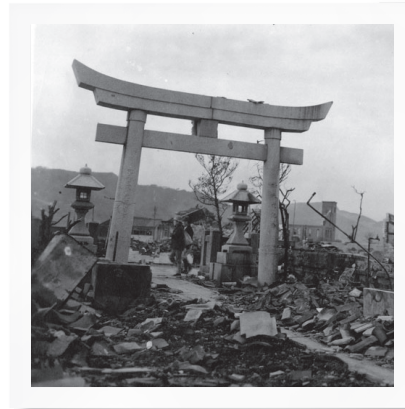
Torii Gate, Nagasaki, Japan (Sept. 1945)

This year the theme for the IHL Youth Action Campaign is: